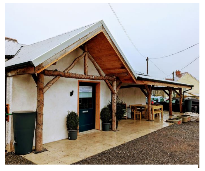
Y Stiwdio eco-building.

The building was officially opened in December 2022.