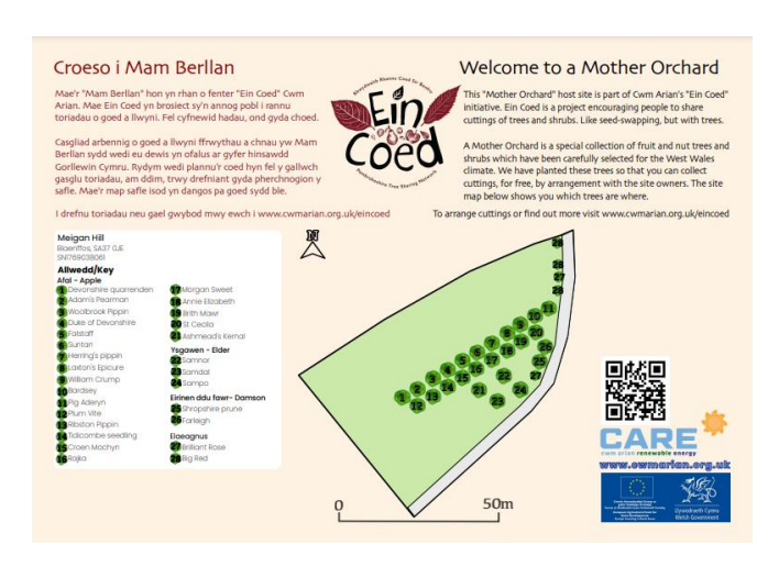
Example of mother orchard placard.

maintained a light-touch approach to administering the Facebook group and this will be continued by CARE.