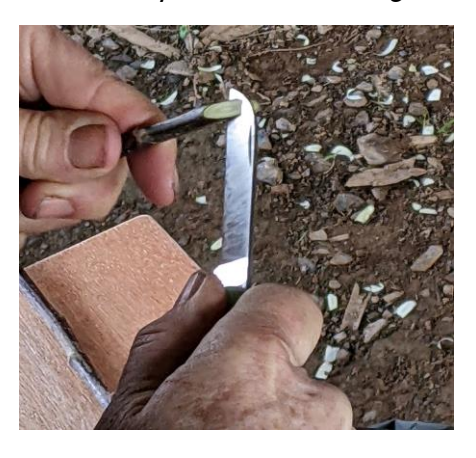
Fruit tree grafting workshop.