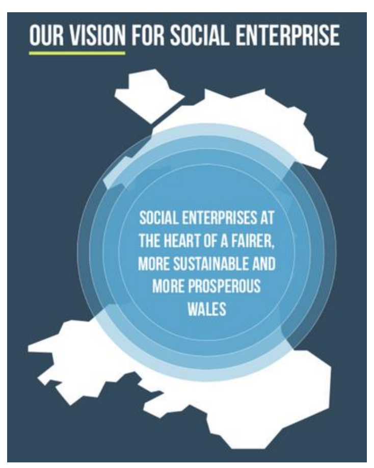
Figure 5: The vision of the 'Transforming Wales Through Social Enterprise' report

Cwmpas' <u>Transforming Wales Through Social Enterprise</u> report 'was born out of collective process involving social enterprises and sector support bodies and has the support of Welsh Government'. The report sets out the vision of the sector from 2020-2030 and anticipates a growth in social enterprises in Wales.