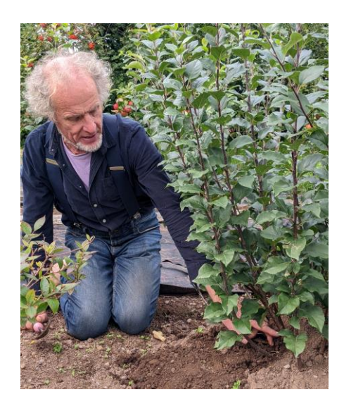
Rootstock production training.

"About winter and summer pruning encouraging vigour and heal and seal"