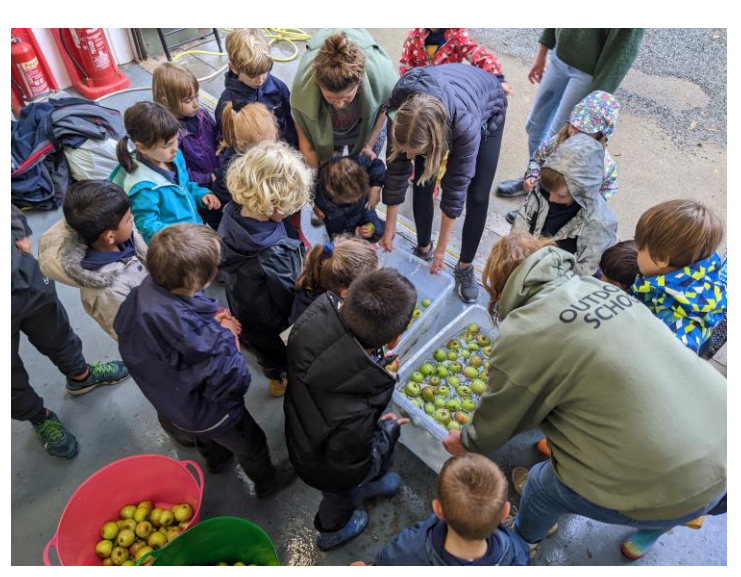
Apple juicing at a primary school in Fishguard.

The celebratory nature of the Dydd Afal event could be built on as it helped to promote the project activities to a wider audience and may potentially engage a broader range of participants for other project activities.