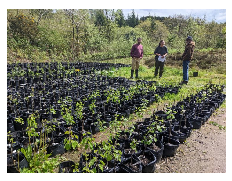
Mentoring site visit to Tyn y Berllan tree nursery.

The mentoring programme was defined in agreements between CARE, mentors and mentees to clarify expectations and commitments with the project team enabling all involved. Mentees and mentors appreciated this, with one mentee saying they felt more comfortable asking for advice knowing the mentor was being paid for their time and having a formal agreement facilitated by CARE.