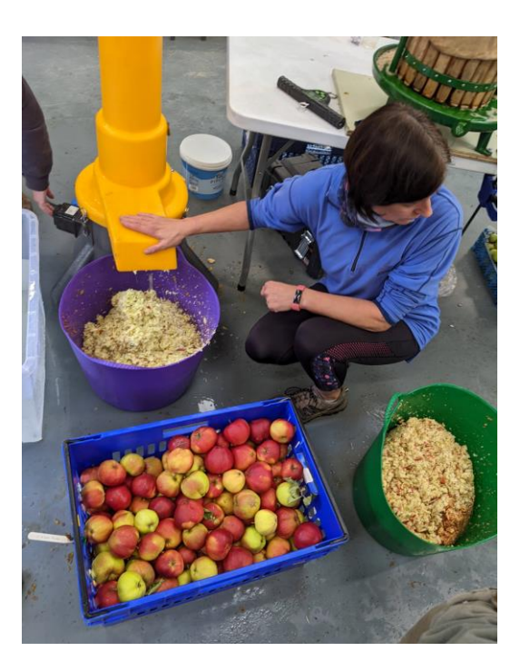
Apple juicing service in action.

The Apple Juicing Service team met to review the service and they identified best practice for future seasons (see Appendices). For example, new equipment, creating and printing info packs, creating volunteer role descriptions. CARE plan to continue offering their Apple Juicing Service and preparations began in June for the autumn 2023 season.