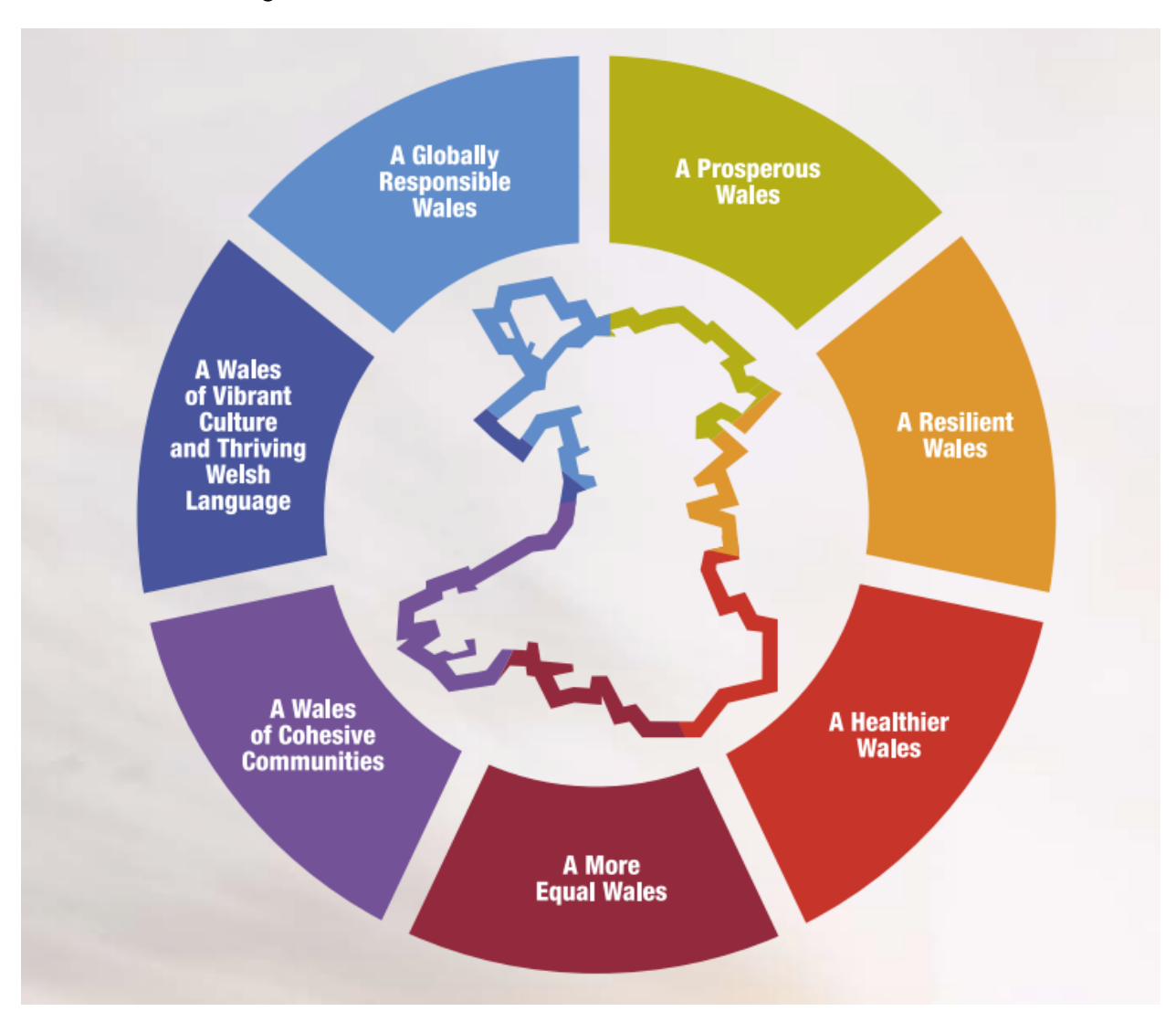
Figure 1: Well-being of Future Generations Act goals (Welsh Government)

The Well-being of Future Generations Act sets out the seven Wellbeing Goals (see Figure 1, above) and five Ways of Working (see Figure 2, below) for national government and Public Service Boards (PSB) which are made up of local government, local health boards and other specified public bodies. The Pembrokeshire PSB includes Fruit and Bounty project stakeholders - Pembrokeshire County Council and PLANED.