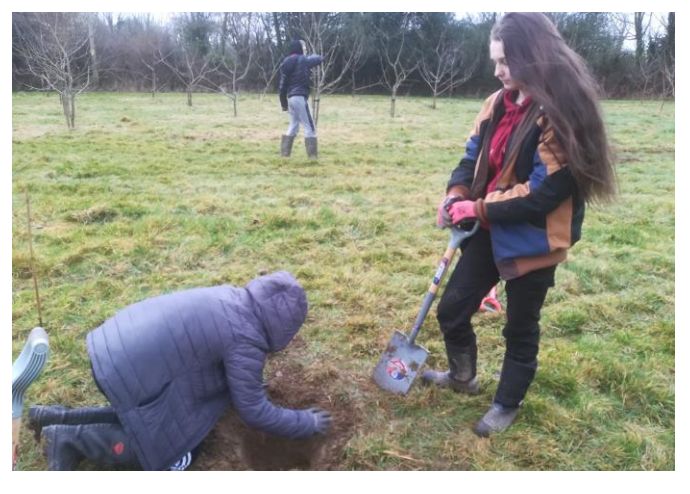
Volunteers help plant mother orchard.

The main point of contact for network members is a dedicated Facebook group. Promotion of the network has drawn over 260 members, many of whom participated in scion wood sharing. As the season for taking and grafting scions has passed activity in the group has reduced significantly, as is to be expected. The project team