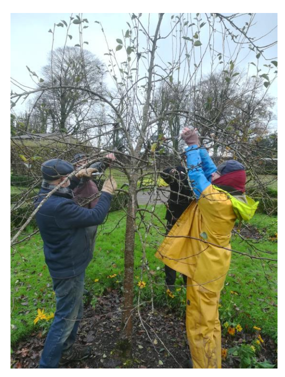
Pruning training day.

The project team took note of feedback about improving throughout the project.