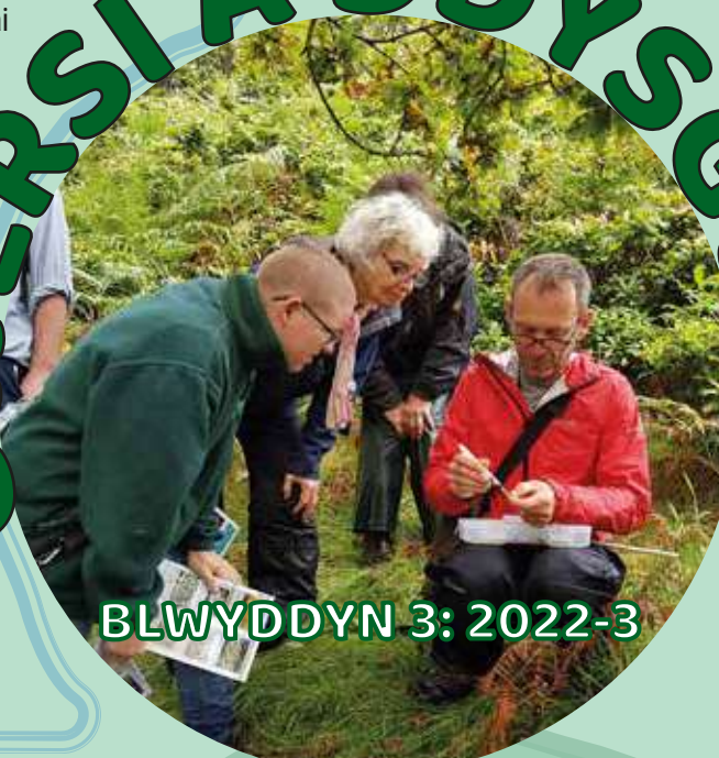
BLWYDDYN 3: 2022-3