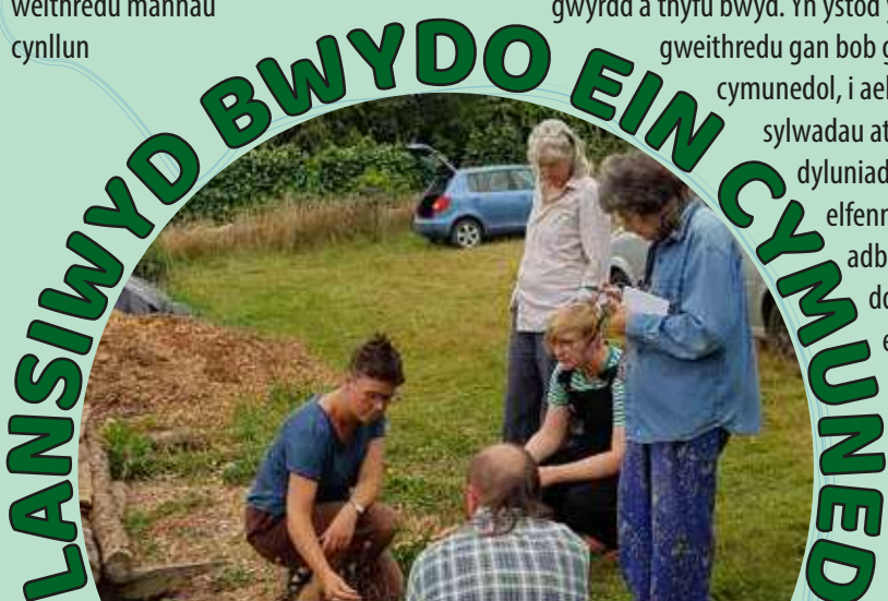
Mân Astudiaethau Achos

"WEDI'I GYNNAL YN DDA IAWN. DIFYR DROS BEN. SYLFAEN WYBODAETH A BRWDFRYDEDD GWYCH. DIOLCH." "DW I'N BAROD I ROI CYNNIG AR BETHAU AR FY MHEN FY HUN." "ROEDD Y CYFAN YN DDEFNYDDIOL: ROEDD GAN BAWB DDIDDORDEB MEWN TYFU A BYD NATUR." "SESIWN DDIDDOROL IAWN, A DW I'N TEIMLO'N FWY ABL I DDEFNYDDIO'R PARATOADAU BIODYNAMIG FY HUN."