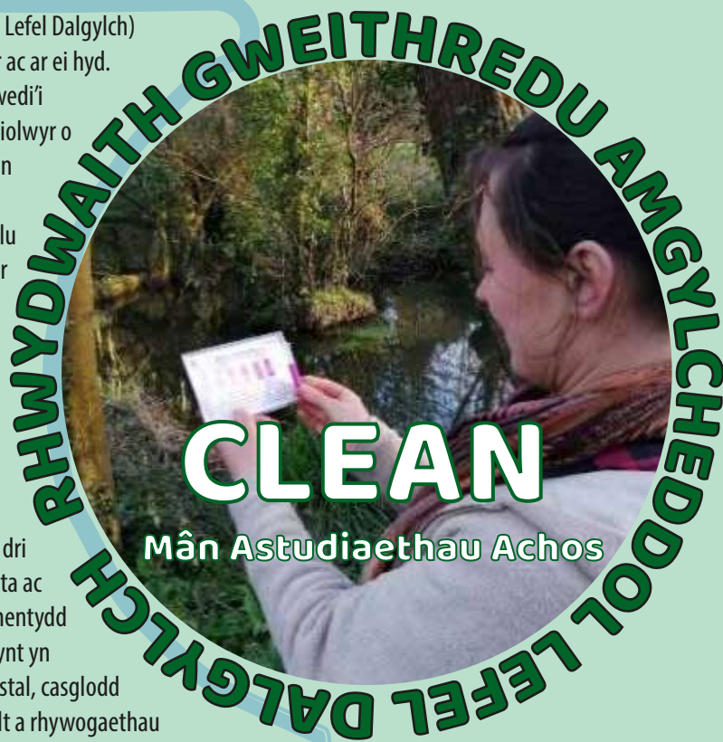
Mân Astudiaethau Achos