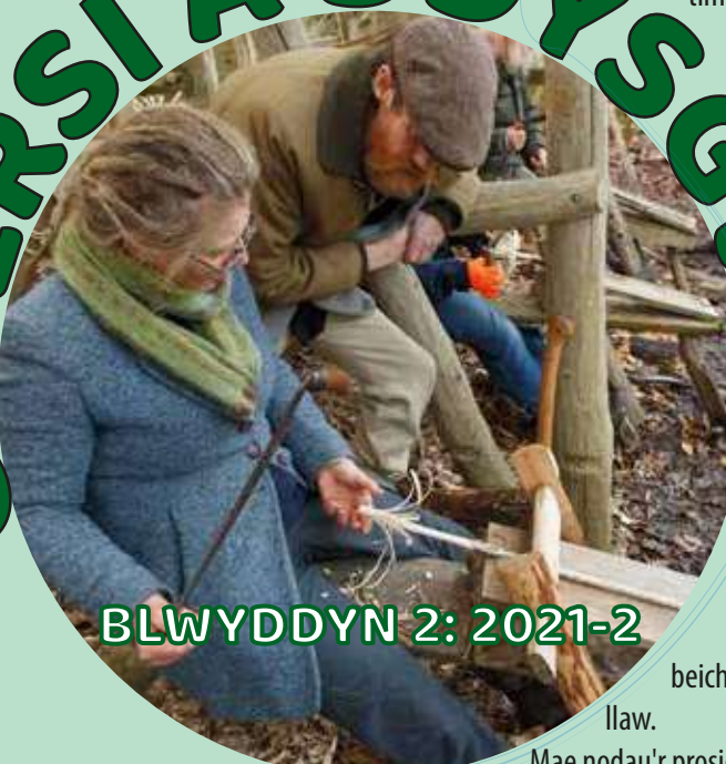
BLWYDDYN 2: 2021-2