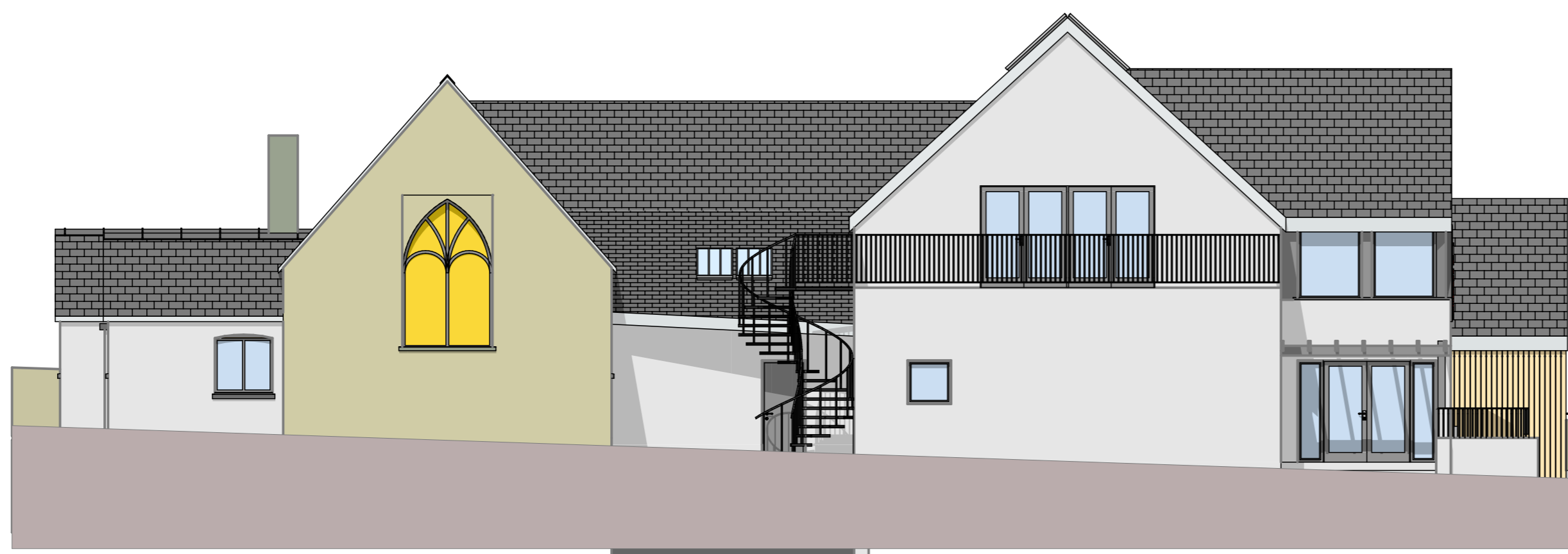
Right Elevation 1:100