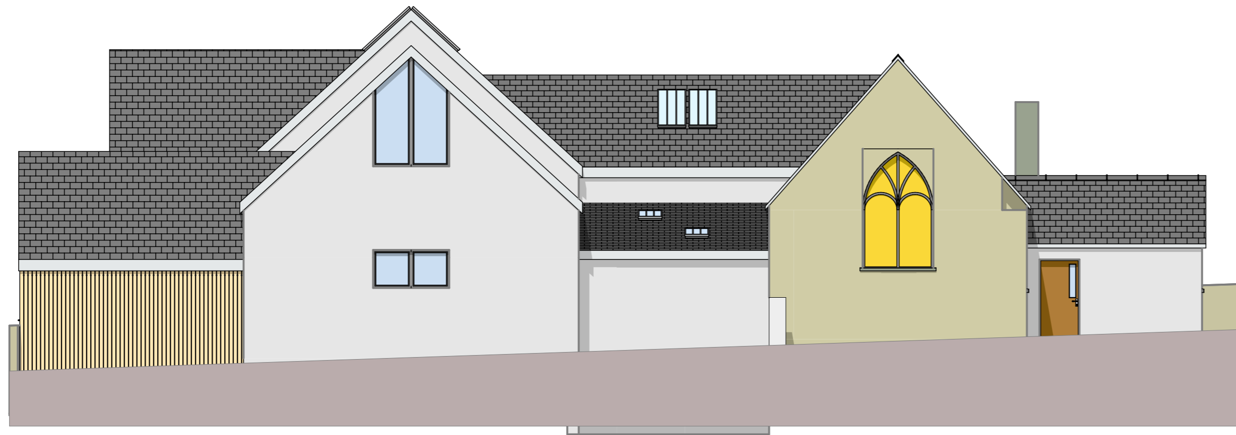
Left Elevation 1:100